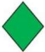
Diamond - Losange