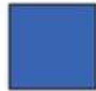
Square - Carré