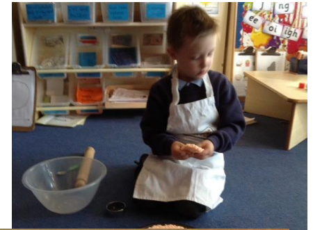
Who Chased the Runaway Pancake? Can you write the animal names? You could write a sentence about the story too.

Shrove Tuesday Play Learning and Exploring Through Play