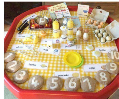
Pancake Day Tuff Tray

Shrove Tuesday Play Learning and Exploring Through Play